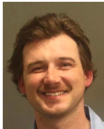
Morgan Wallen mugshot.

However, his legal team released a brief